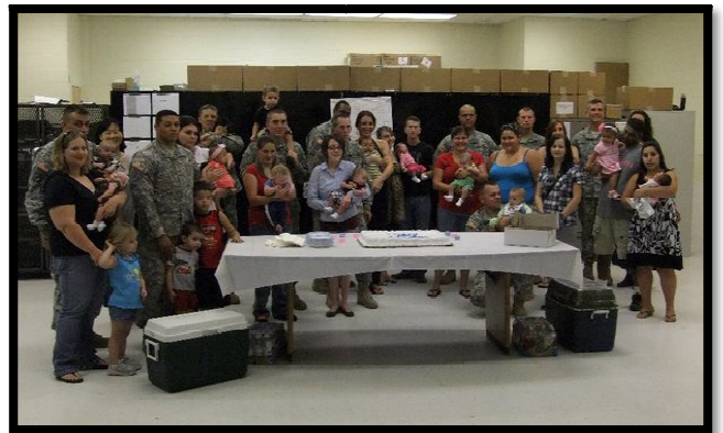
New Vanguard Babies and parents.

Since we have returned from JRTC, the Vanguards have shifted their focus to the coming deployment in mid-November. Baggage and hazardous materials have been packed, sealed, inspected, and sent to the port and the Soldiers are undergoing their medical and dental checks. On 29 September, we took time out of our busy schedule to conduct the Vanguard Baby Celebration. During this event, we recognized all of the new Vanguard Babies that have joined the formation since May. Parents were given a certificate and the Little Vanguards received a Vanguard Baby onesie. We concluded the event by singing Happy Birthday and having cake.