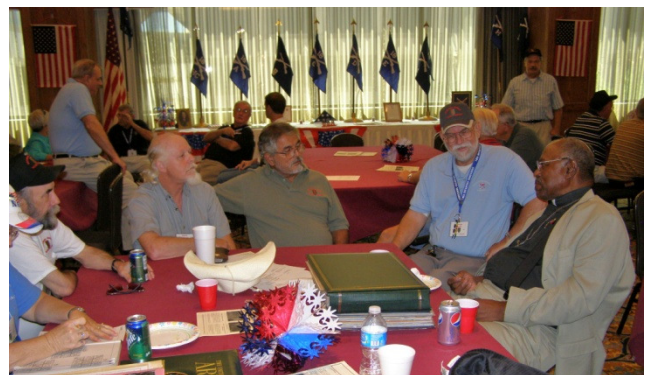
Telling war stories in CP (some of which are even true!)